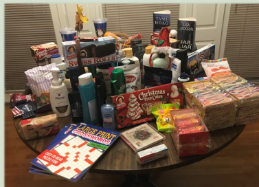
Donations for Veterans Center in Wilmore