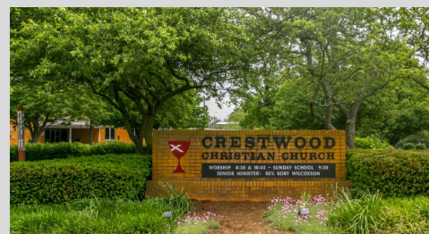
Above: Freshly visible Crestwood sign Below: Sparkling clean Chalice Hall

During the continued closing of Crestwood's physical facility during this pandemic, the Property Team has remained active. The painting project in the Mission Center, Chalice Hall, and Chapel has been completed. We worked on the front Crestwood sign, removing tree limbs to improve the sign's visibility and weeding the area in front of the sign. Two of the retention ponds near the north parking lot have been cut and cleared. We picked up three bags of trash in those areas and removed the cut debris. Also, clean-up work has begun in the playground area.