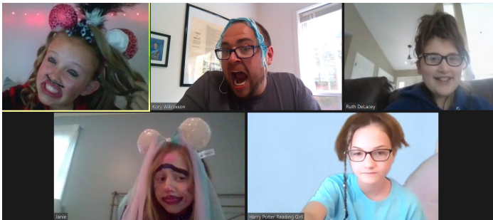
Wacky Hair Wednesday on Tuesday with Chi Rho Youth