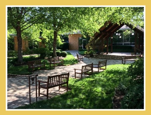
Sunday, October 18, 2:00 PM

DWM members are invited to enjoy a brief celebration in the garden at Crestwood. Piano and harp music provided. Guests should wear masks, and chairs will be socially distanced. Please park in the South Parking Lot (by Glendover school) and enter the courtyard from the Childcare Center doors. Come and help celebrate the 60<sup>th</sup> anniversary of Crestwood Christian Disciples Women's Ministries!